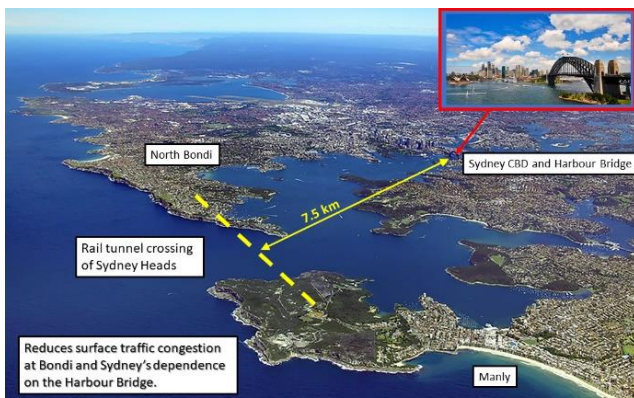
A rail tunnel across Sydney Heads

A rail tunnel under Sydney Heads would connect the Sydney CBD through to Gosford via a 60km long tunnel extending from Bondi Junction Station on the Eastern Suburbs/Illawarra Line. Brookvale would become a new satellite CBD, only 20 minutes train travel time from the Sydney CBD. Ultimately the project could morph into a faster rail link between Newcastle, the Sydney CBD and Canberra. Another option would be to connect the proposed Sydney Metro West to the Eastern Suburbs railway line via the existing Martin Place Station. The Town Hall Station lower platforms of the Illawarra Line would then be connected directly to St James Station's new lower platforms via new tunnels. New tunnels, south of St James Station, could then be taken to Malabar for example. The project would also reduce urban traffic congestion and more broadly, improve road safety, by reducing the number of cars on our roads.